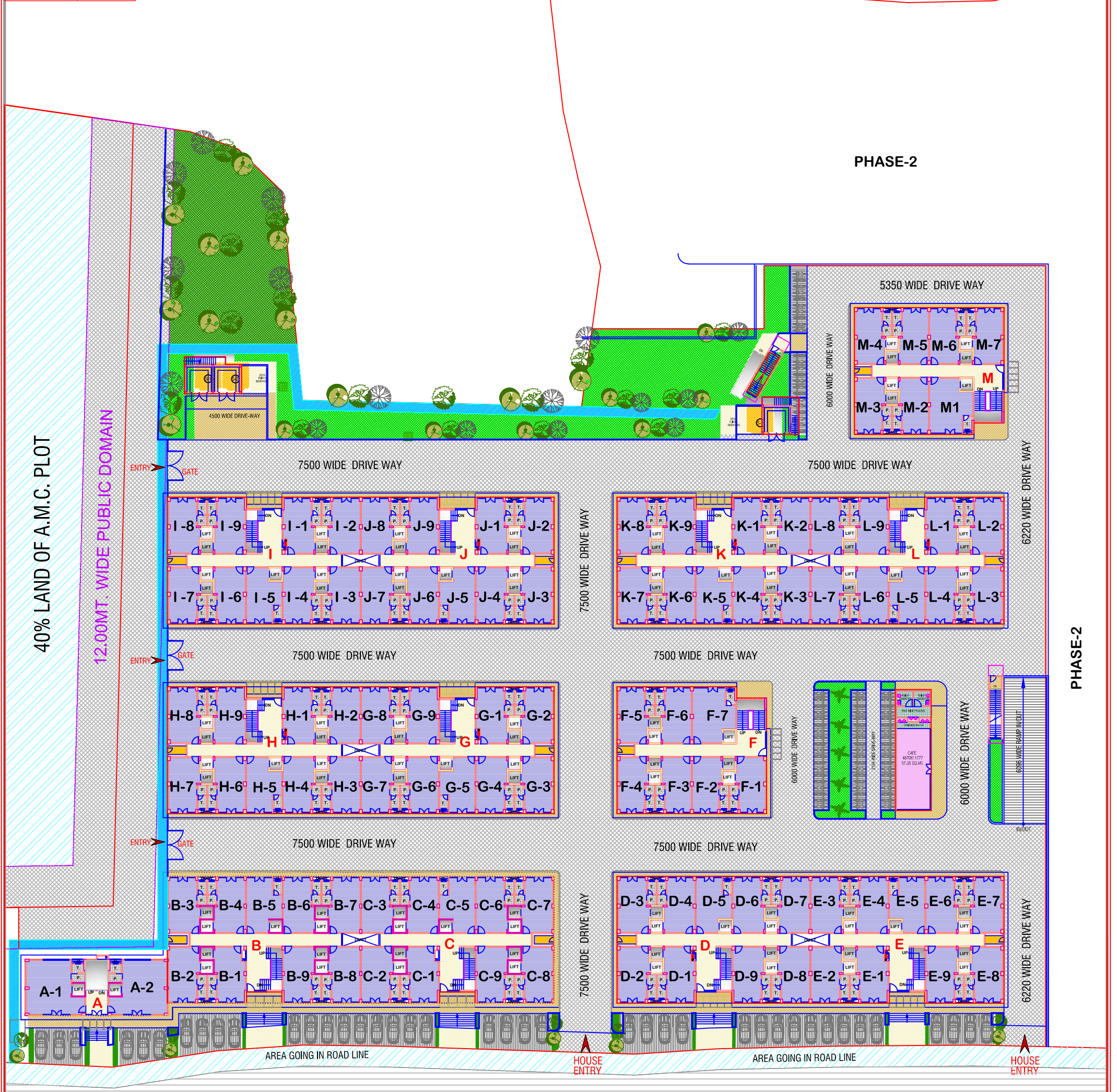
PROP. 18.00M WIDE R.D.P. ROAD